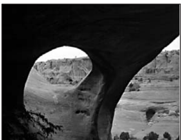
Cavern Arch, Lost Spring Canyon

The other side of this page contains a detailed map of the route from the highway to Lost Spring Canyon. Your odometer may vary slightly from these measured distances. This route begins as a very good, very straight dirt road, headed toward the La Sal Mountains.