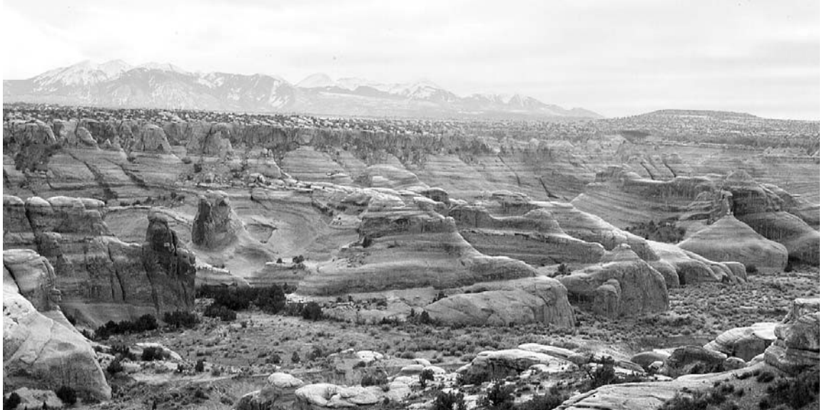
A view into Lost Spring Canyon

This 3,140-acre area was added to Arches National Park in 1998. It provides a unique backcountry experience. The Bureau of Land Management administered the area as a Wilderness Study Area since 1985, though Lost Spring Canyon has been grazed for years. When it was added to Arches, the Grand Canyon Trust generously purchased the grazing permit and donated it to the National Park Service. Livestock were removed and will be fenced out, enabling the National Park Service to begin vegetation monitoring, protection and restoration efforts. In addition, the removal of livestock has eliminated potential conflicts between recreational backcountry visitors and active livestock operations.